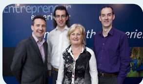
1st Entrepreneur Experience™ delivered by CorkBIC