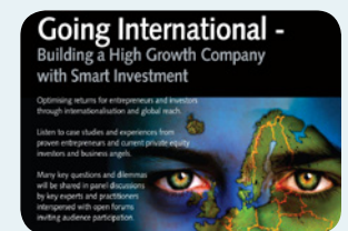
CorkBIC delivers 1st Going International Conference in Sophia Antipolis, France