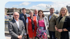
Celebrating High Growth Startups at the Port of Cork