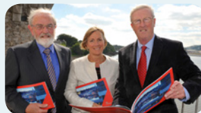
Celebration of 25 years of CorkBIC @ Blackrock Castle & Launch of 25 year brochure

HBAN nationally reaches 139 deals, €61m invested