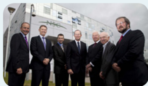
NSC celebrates 10th Birthday