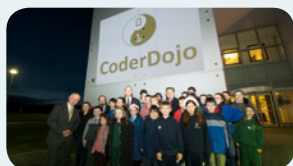
CoderDojo celebrates 220 Dojos in 31 countries

Irish BICs announce 100th Deal for its Business Angel Partnership with €40m raised since it was founded in 2007