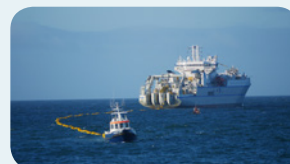
CorkBIC welcomed High performance transatlantic cable to Cork

The Startup Gathering Event & Startup Cork Dinner co-hosted by CorkBIC