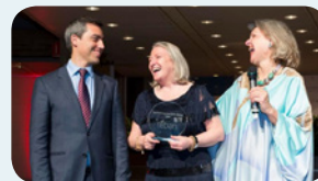
CorkBIC Awarded Best performing New EBAN Member 2014