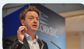
Business Without Boundaries & Venture Academy™ - Keynote David McWilliams

Bank of Ireland National Accelerator Programme located in Cork