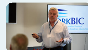
CorkBIC Venture Academy™