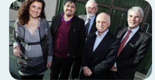
CorkBIC and it's Business Angel Partnership host 1st International Venture Academy™ in Cork

HBAN reaches 60 deals with €22m invested of which CorkBIC does 20+ Angel deals with €8m invested