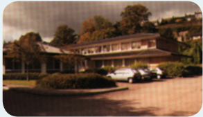
CorkBIC South West Business & Technology Centre Formed