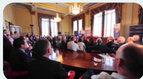
CorkBIC celebrates the New Economy at the Port of Cork - HPSU Showcase