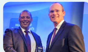
BOI Accelerator Demo Day & Dinner supported by CorkBIC