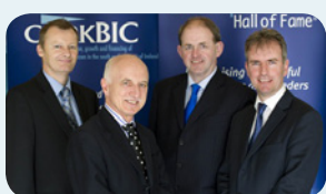
1st Inductees to the Entrepreneur Hall of Fame®