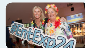
2017 Entrepreneur Experience™