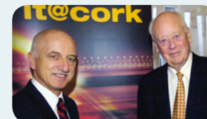
CorkBIC brings Charles Handy to Cork

Cork County Council in partnership with Cork Chamber, Enterprise Ireland, & CorkBIC develop a Strategic Alliance with Chicago/ Cook County Illinois, USA