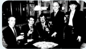
Launch of it@cork at Murphy's Brewery in November

The first Irish Seed Capital Fund formed by the Irish BICs with private sector & EU funds