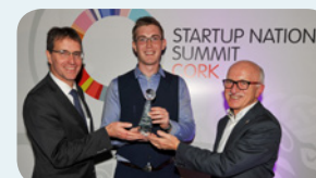
CorkBIC Global Investor Challenge - Spike Island & Final at Startup Nations Summit Dinner