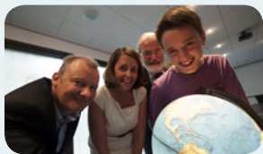
1st Going International Conference in Cork