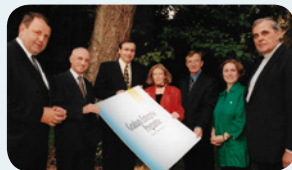
CorkBIC Launch of Graduate Enterprise (Rapid Incubation) Programme in association with EI, UCC, CIT & ITTalee

Dissemination of results of CorkBIC / Cork Corporation survey to establish it@cork