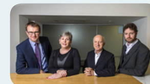
Launch of International Security Accelerator