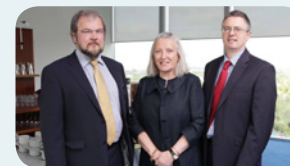
it@cork Dealbroker event, Vertigo, County Hall