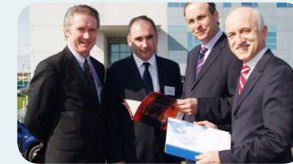
Irish BICs launched National pilot of Halo Business Angel Partnership (BAP) with Enterprise Ireland & InterTrade Ireland

CorkBIC worked with Cork City to establish the CCMAN (Cork City Metropolitan Area Network)