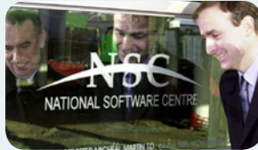
CorkBIC puts together a funding consortium to establish a National Software Centre (NSC)