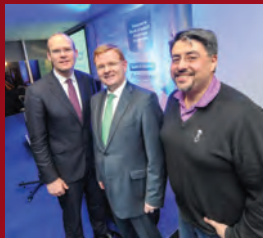
Bank of Ireland Accelerator Demo Day & Dinner supported by CorkBIC