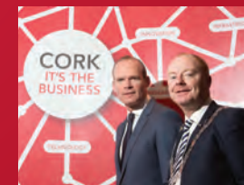
Supported event: Locating World class Eco Datacentres in Cork