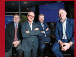
Launch of 2016 Entrepreneur Experience ® in Cork & Dublin