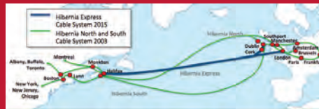
Project development of the first subsea fibre London-NYC to be laid in 12 years