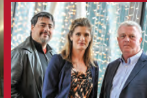
The Venture Academy delivered by CorkBIC