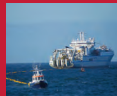
"Bringing the Cable Ashore" Garretstown, Co. Cork