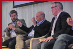
2015 Entrepreneur Experience ® delivered by CorkBIC