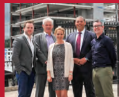
Celebrated High Growth Startups at the Port of Cork